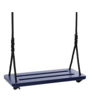
navy blue: AC-RS-NB