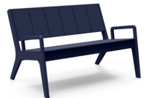
navy blue: NO-NO9S-NB