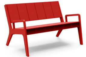
apple red: NO-NO9S-AR